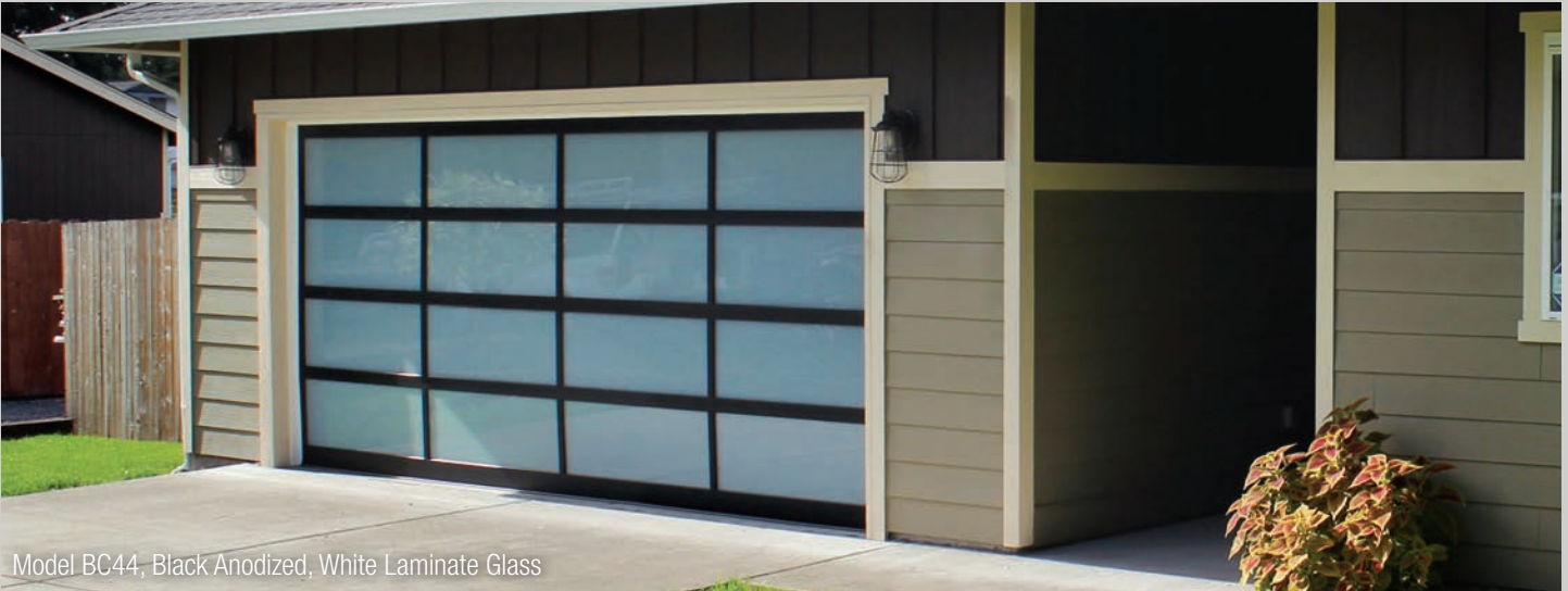
Model BC44, Black Anodized, White Laminate Glass

According to Remodeling Magazine's Cost vs. Value Annual Report , year after year, a garage door replacement with upscale garage doors has continued to be one of the highest ROIs ( Return on Investment ) of all exterior remodeling projects.