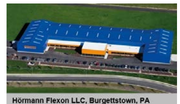
Hörmann Flexon LLC, Burgettstown, PA