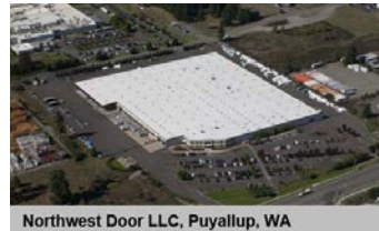
Northwest Door LLC, Puyallup, WA

Hörmann Northwest Door, LLC 19000 Canyon Road East, Puyallup, WA 98375-9746 Phone: 253-375-0700 Fax: 253-375-0800 Email: info@northwestdoor.com www.northwestdoor.com