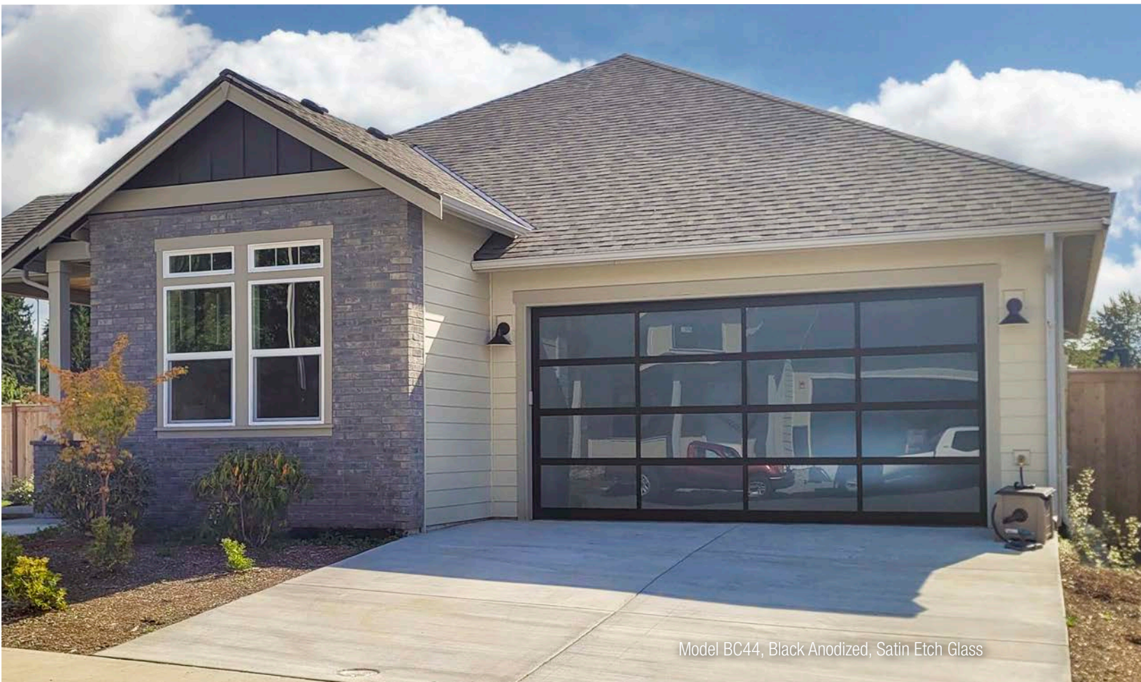
Model BC44, Black Anodized, Satin Etch Glass