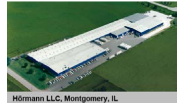
Hörmann LLC, Montgomery, IL