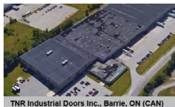
TNR Industrial Doors Inc., Barrie, ON (CAN)