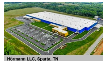
Hörmann LLC, Sparta, TN