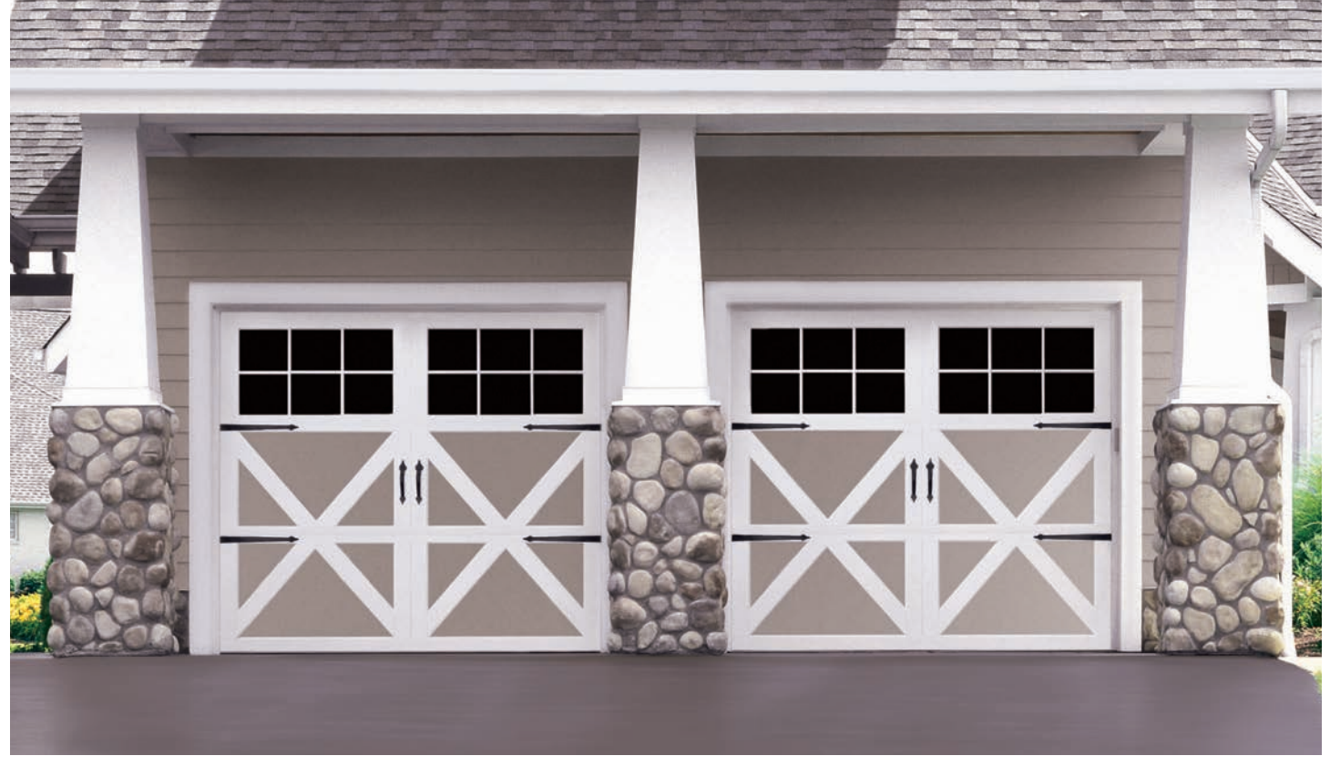
Model 9700 shown in Lexington design with 12 window square and optional decorative hardware