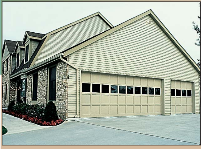
Colonial Wood Panel Garage Door

Good styling endures, and so does quality construction. Both make the Colonial door a prudent investment for your home. Colonial doors are made from high-quality, kiln-dried Western woods in sizes and styles to complement a range of architectural designs. Your choice of a Colonial wood panel door will keep rewarding you year after year.