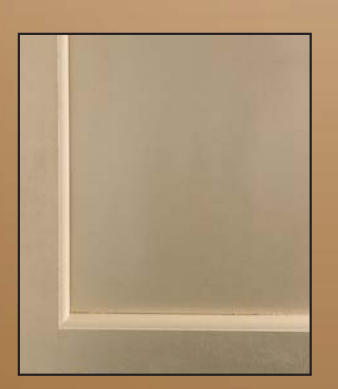
Individual Colonial door sections are a full 1-3/8" thick

First impressions last, and a Colonial wood panel door gives your home a quality appearance that endures year after year. Designed for easy operation and strongly built, Colonial doors make beauty and convenience surprisingly affordable.