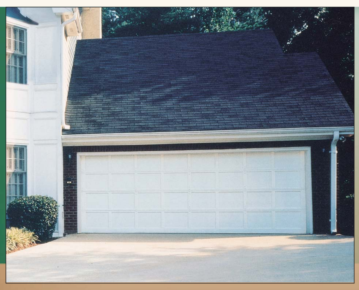
Colonial wood panel garage door

The warm look of traditional wood panel doors